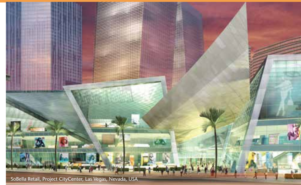
SoBella Retail, Project CityCenter, Las Vegas, Nevada, USA

Building Insight expresses our in-depth knowledge and experience. To address complex systems, Lerch Bates consultants don't replicate, they innovate. We are at the forefront of innovation in architectural, organizational and operational systems for “back of house” support areas and bring a creative approach to each project.