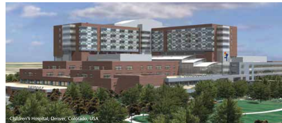
Children's Hospital, Denver, Colorado, USA