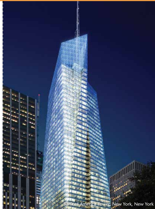
Bank of America Tower, New York, New York