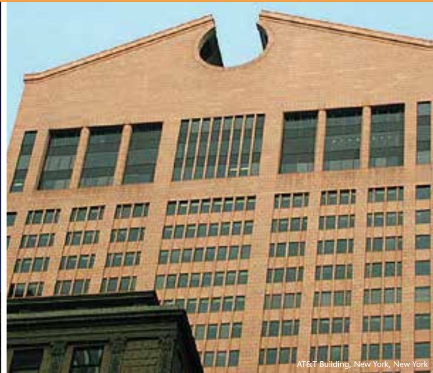
AT&T Building, New York, New York